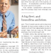
Author of 'Sound of Music' article.