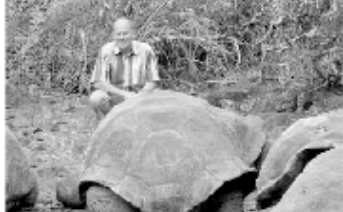
The commodore of a global DNA census voyage.